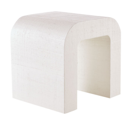
Accent table between 2 chairs - CB2