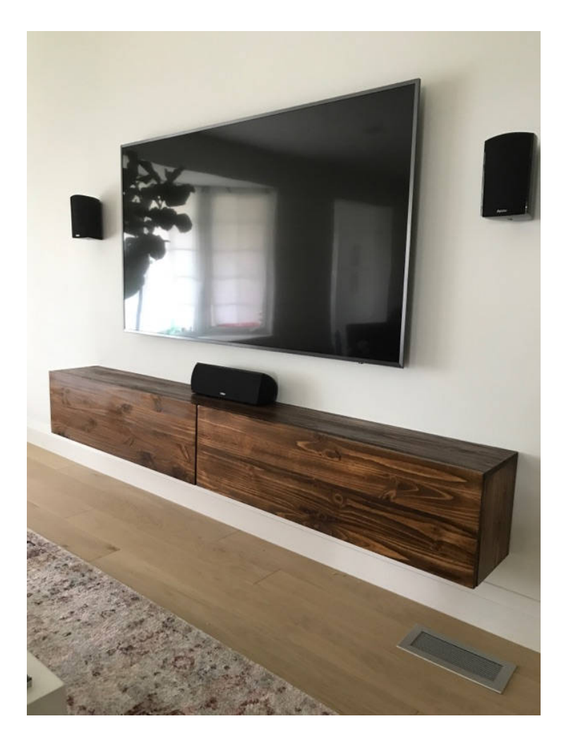
Floating TV console (TV or artwork) to be mounted Etsy