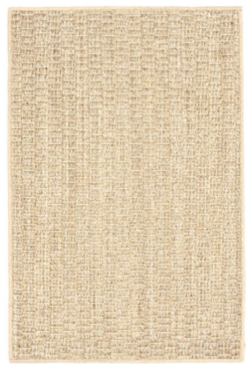
'Bottom' Layered rug - Jute 10x14 Annie Selke