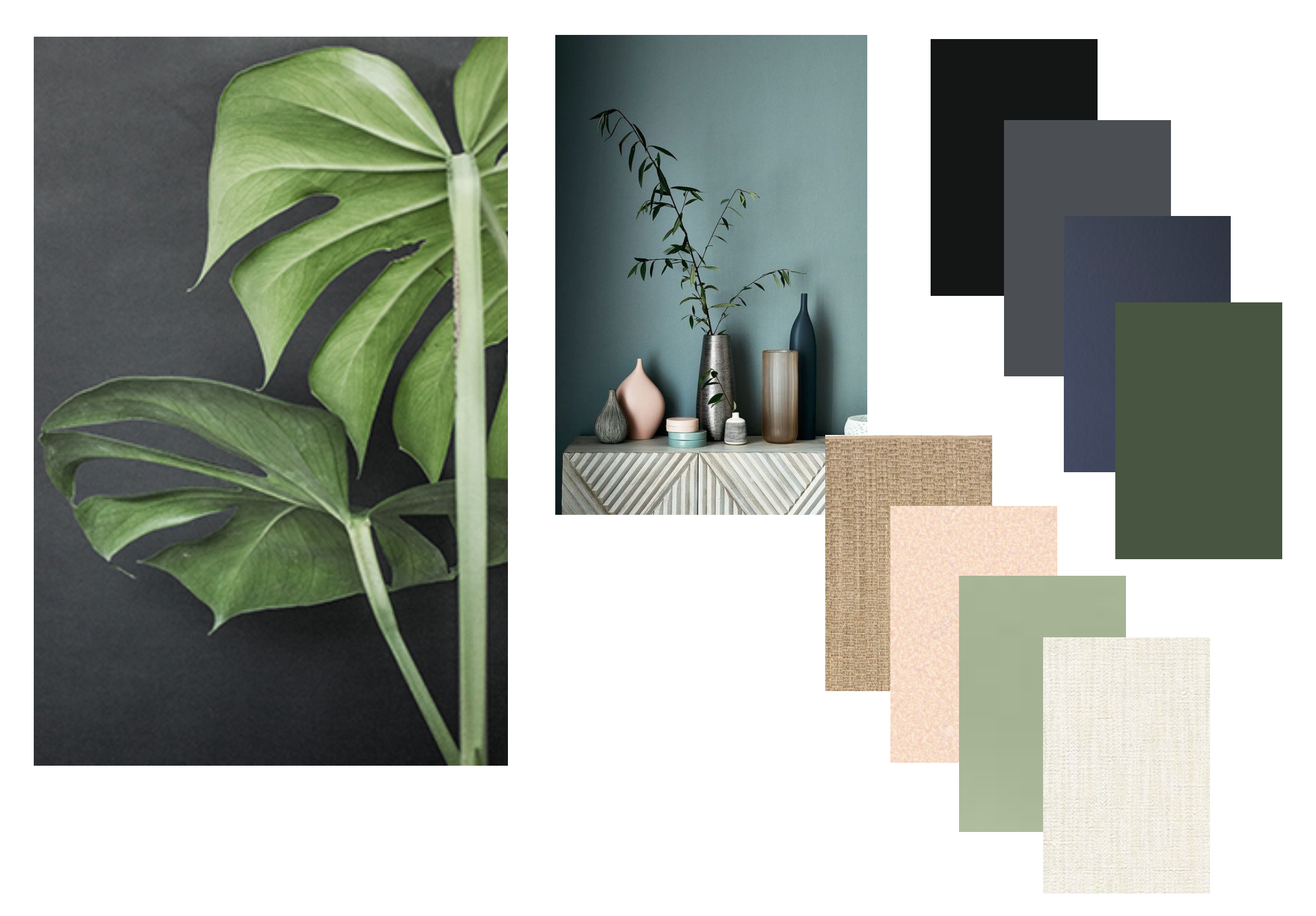
Color Story Botanical inspired hues with pops of warm accents