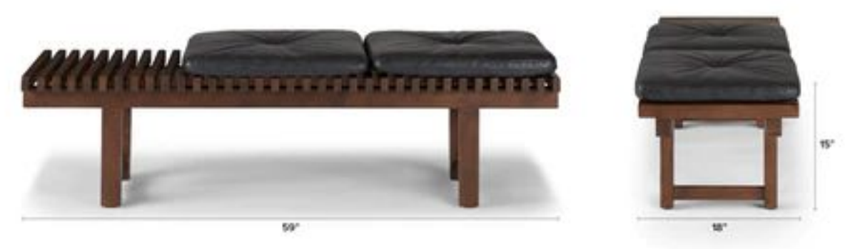
Bench Option 1 - Article