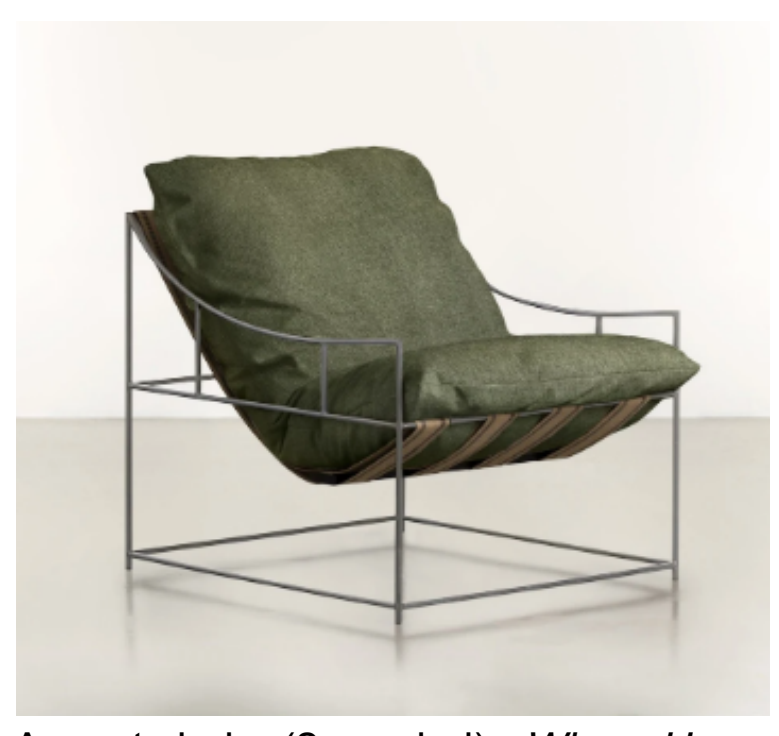
Accent chairs (2 needed) - Whom Home To replace existing white sofa