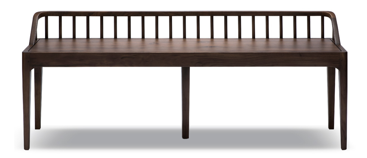
Bench Option 2 - Industry West