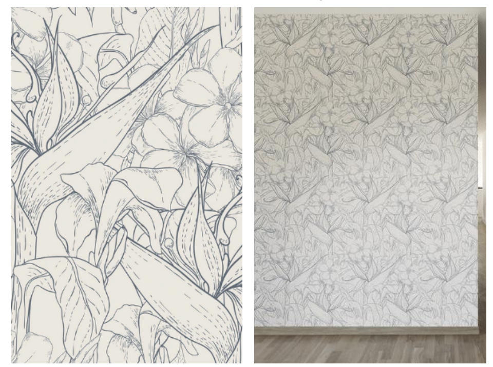
Solid - Option 1 - Grasscloth - Tempaper