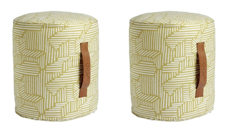
2 Ottomans to live under floating console Burke Decor